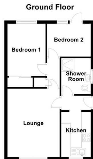
Not to scale. For illustrative purposes only